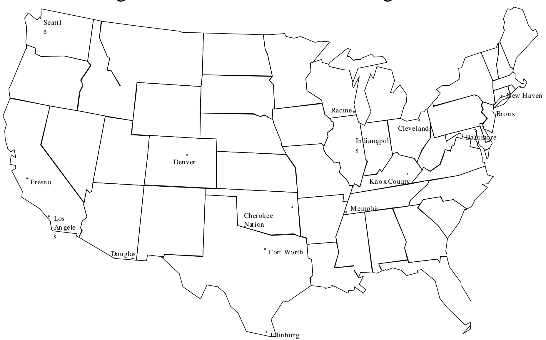
Figure I.1 Youth Fair Chance Programs